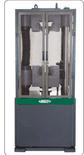
steel wire safety shield (optional)