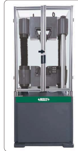
acrylic safety shield (optional)